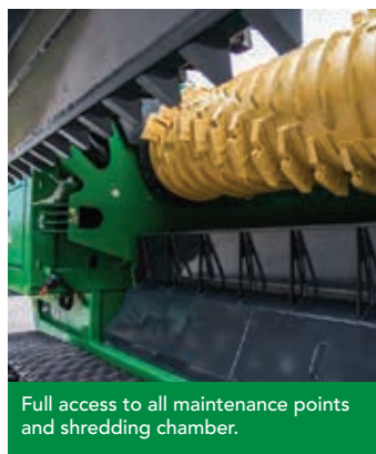
Full access to all maintenance points and shredding chamber.