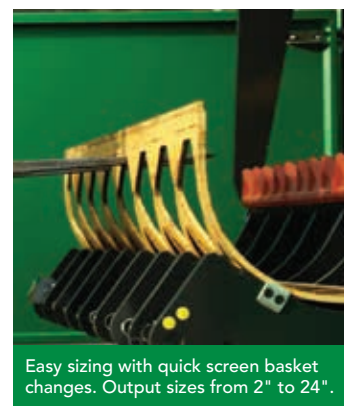
Easy sizing with quick screen basket changes. Output sizes from 2" to 24".