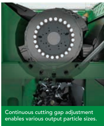
Continuous cutting gap adjustment enables various output particle sizes.